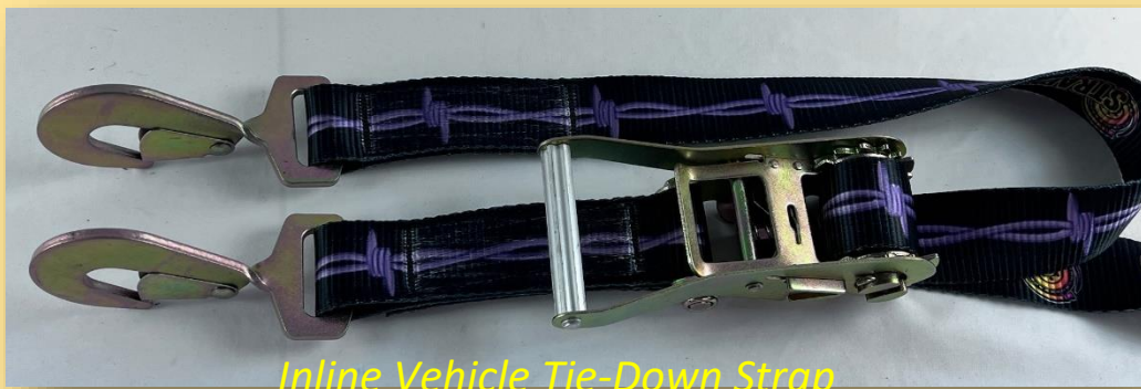
Inline Vehicle Tie-Down Strap