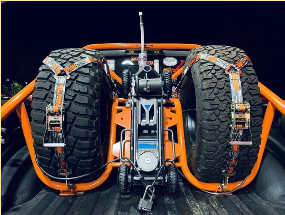
Not traditional, but we think it's pretty neat!

We used to make fixed tie-downs. We found that making the strap assembly adjustable, you get way more value with the ability to tie-down several sizes of tires. The TRI-TIRE TIE-DOWN is most often used on off-road vehicles (Baja racers as well as rock crawlers). We'll need your tire diameter as well as the spans of your anchor points. Available with flat or twisted snap hooks, wire hooks, flat hooks and j-hooks. All models are made with 12K webbing and 10K hardware and stitching. All made to your specs (with room to spare).