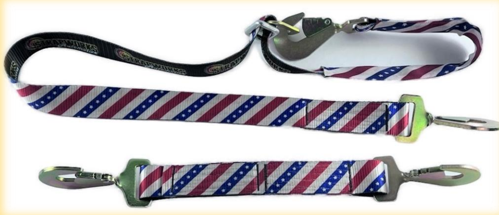
Top Photo- Adjustable Tie-Back Bottom Photo- Fixed Tie-Back