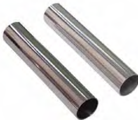
ALUMINUM STRAIGHT TUBES