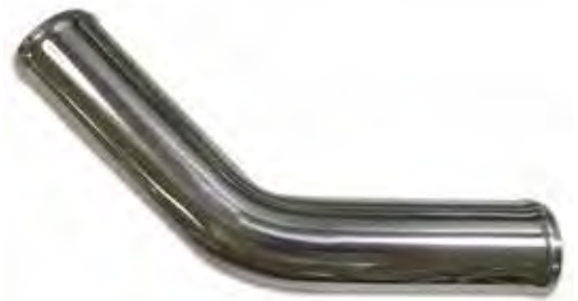
ALUMINUM 45° TUBES