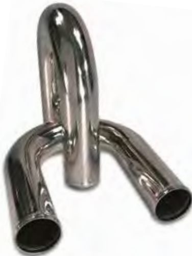
ALUMINUM 180° TUBES