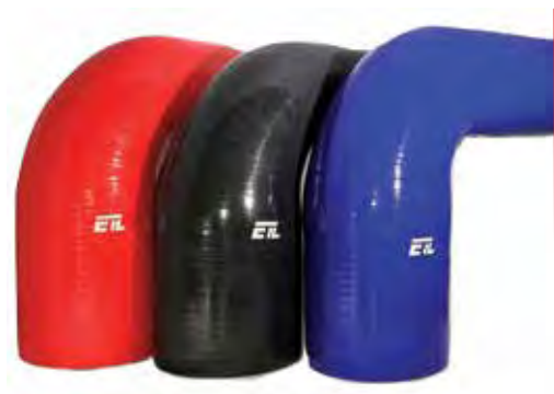
4 PLY 90° REDUCER HOSES

ETL Silicone Hoses are manufactured with a 4 Ply, High Quality Aramid - Silicone blend designed to withstand extreme temperatures of -65 Degrees Fahrenheit to 350 Degrees Fahrenheit. Each Silicone component has been burst pressure tested to 140 PSI to ensure quality.