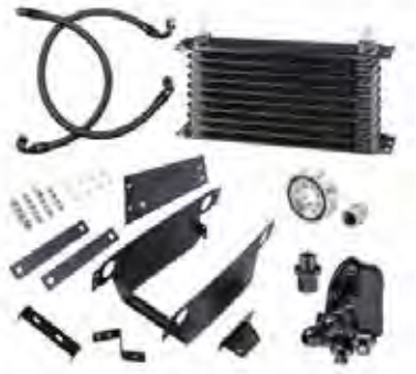
Toyota GT86 Concept & BRZ