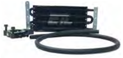
2016 Honda Civic CVT