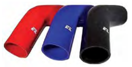
4 PLY 45° HOSES