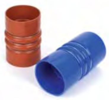
HIGH TEMPERATURE HOSES