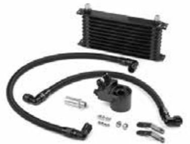
2016 Honda Civic 1.5T