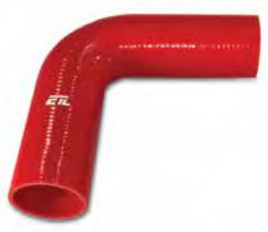
4 PLY 90° HOSES