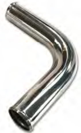
ALUMINUM 90° TUBES

Manufactured with T-6061 Polished Aluminum, ETL Performance offers a wide variety of aluminum piping to meet your custom needs. ETL offers 180, 90, 45 Degree Mandrel Bend, Straight Piping and Custom Bends. Aluminum T-Joiners and couplers are available as well.