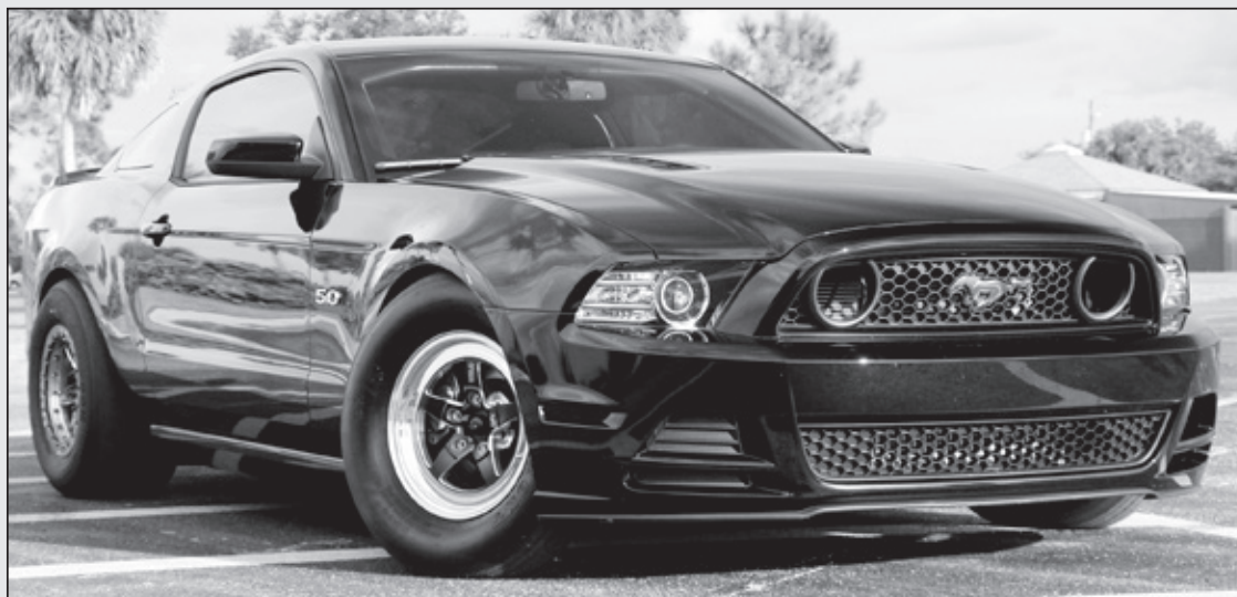
MPR Racing Engines

Note: "LW" = "Lightweight" design rod and "SW" = "Standard Weight" design rod * HX Series rod bearings with .001" extra clearance