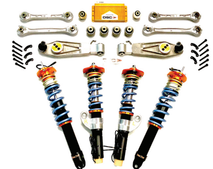
GT2 RSx Suspension Package

With the ability to electronically control and tune your suspension, the DSC Sport controller inputs the live CAN-bus data and uses it's unique algorithm to independently control each damper from full rebound to full compression in under 6ms! This allows for your handling experience to be brought to a higher level of confidence in the vehicle, maintaining grip and stability of the vehicle, and utilize the main projectory of load, G-Force, to determine itself what is the best compression or rebound setting to each damper. The job of the of the DSC Sport Controller is to keep the vehicle flat, stable, and the tires planted without disturbing the chassis.