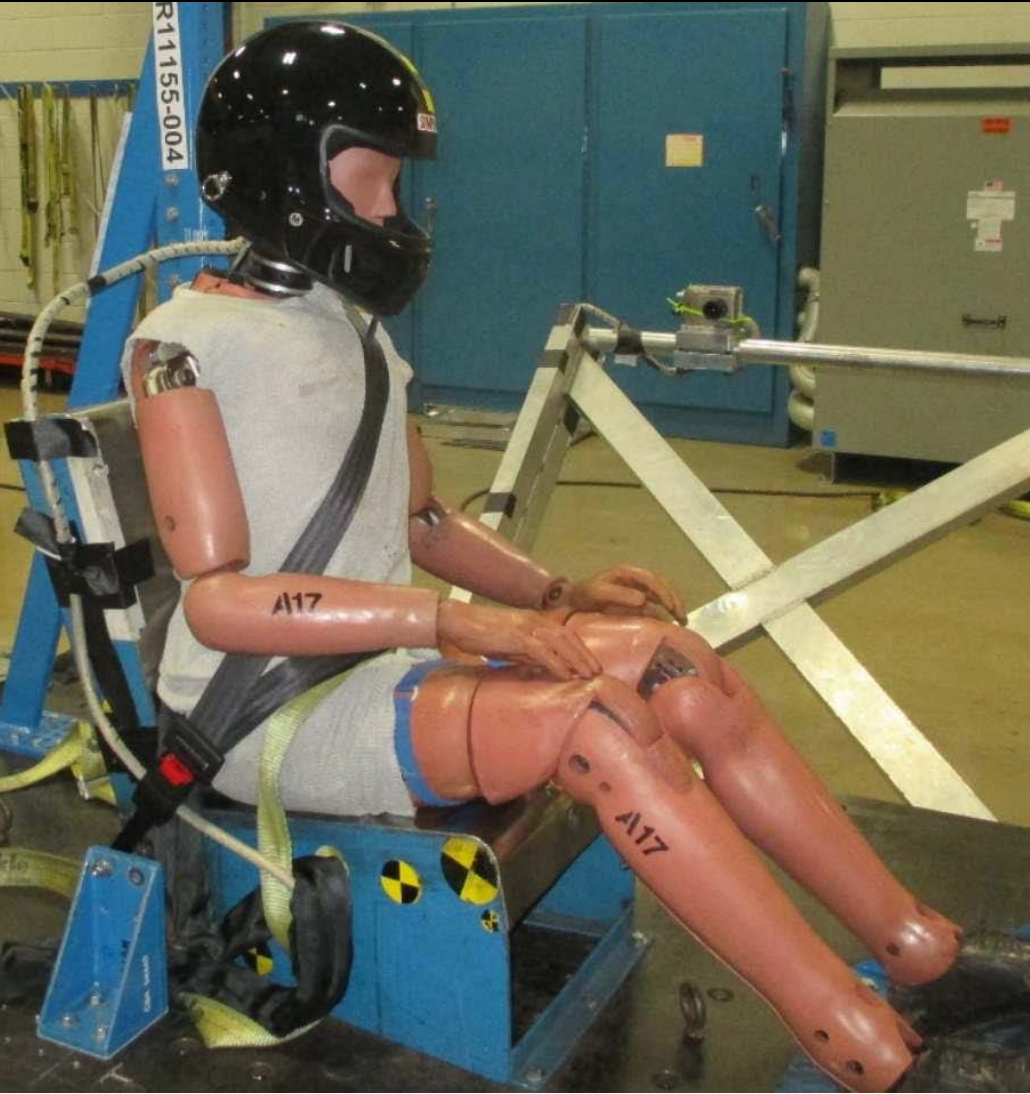
3- Point Sled Test Baseline Test