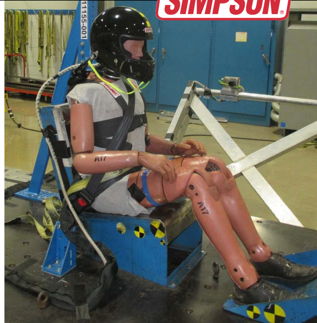
with Hybrid S, SAS straps removed.