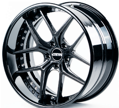
RS5 3 piece

*All Litespeed Racing wheels can be made as 3 piece construction.