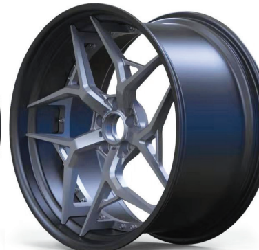
VR5 3 piece