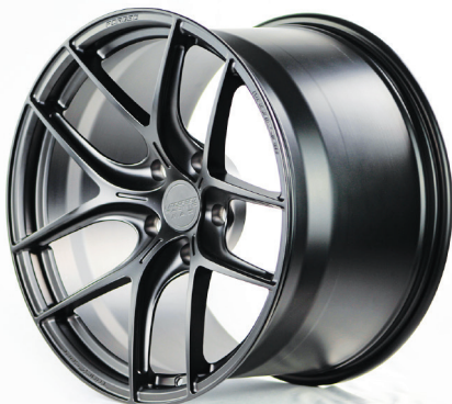
RS5 track spec