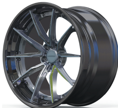
VS10 mag+ 3 piece