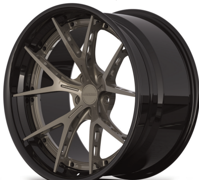
RS5RR mag+ 3 piece