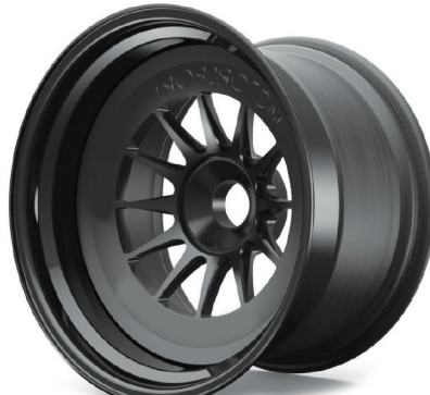
F-1R 3 piece