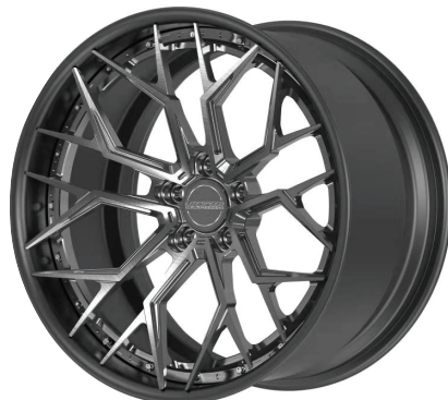
VR20 3 piece