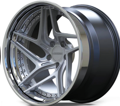
RS5D 3 piece