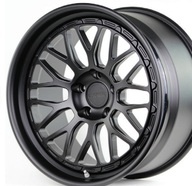
GT10 3 piece