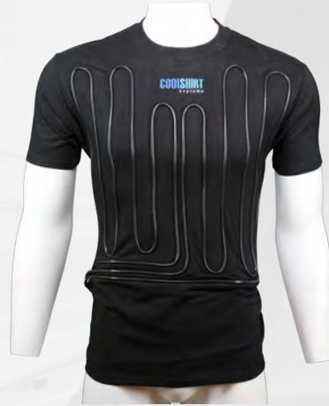
Black Cool Water Shirt Size: XXS-XXXXL 1012-20XX | $167 - $216