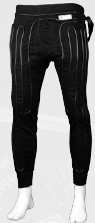
Firewear Pants (SFI 3.3) Size: S-XXL 1032-20XX | $395