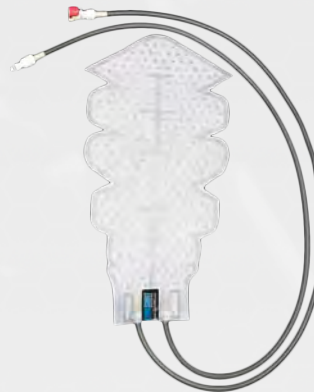
Cool-A-Clava One Size Fits All 1504-0001 | $115