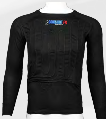
2COOL FR Shirt (SFI 3.3) Size: S-XXL 1024-20XX | $301 - $330