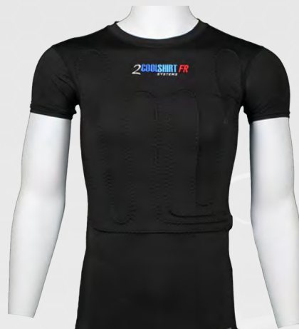
2COOL FR Short Sleeve Size: S-XXL 1025-20XX | $294 - $322