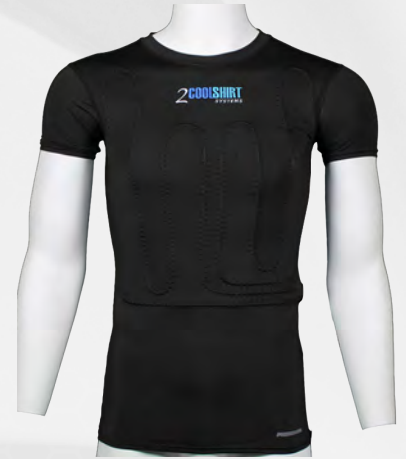
2Cool Compression Shirt Size: S-XXL 1021-20XX | $286