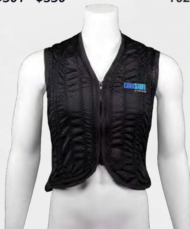
Active Aqua Vest Size: XS-XXXXL 1052-20XX | $327 - $372