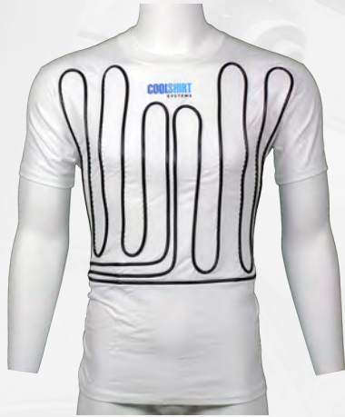
White Cool Water Shirt Size: XXS-XXXXL 1011-20XX | $167 - $216