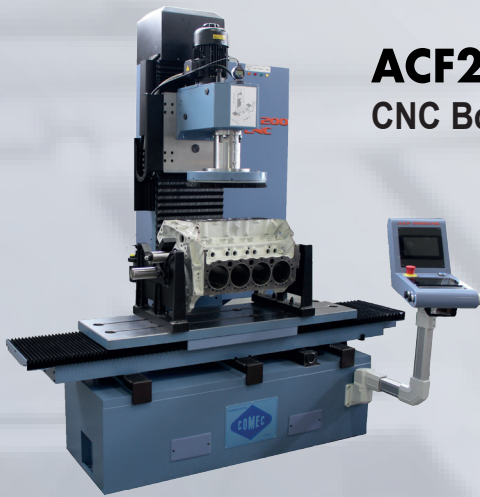
ACF200.CNC CNC Boring Mill