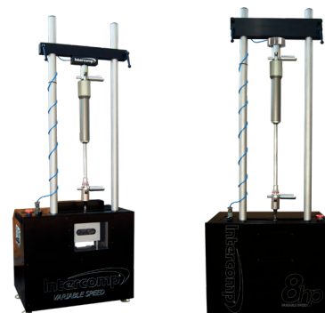
Intercomp's competitively priced variable-speed dynos allow our 3hp and 8hp units to take the place of multiple low-power systems capable of producing only limited shock shaft velocities.