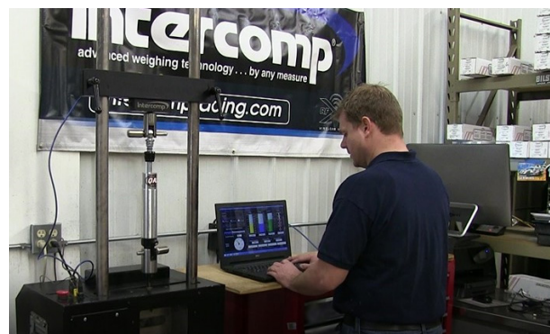
Precise shock analysis is made possible on Intercomp's Shock Dynos due to industrial-grade components.

Aside from tracking performance changes, an Intercomp Shock Dyno provides the race engineer, shock specialist or crew chief the data to make specific shock changes to better control the handling characteristics of a vehicle. Likewise, it gives sportsman racers the ability to report specific numbers to a chassis builder, or other specialist, increasing the chance of obtaining helpful input.