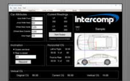
Center of Gravity Calculation