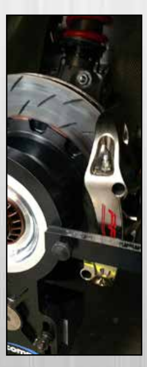
RFX<sup>™</sup> Wireless Precision Hub Plate Scale System