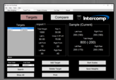
Target Tune Feature