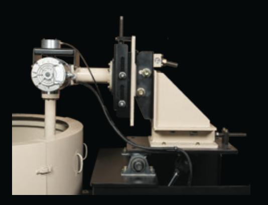
Head Down Process Position