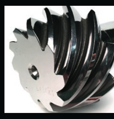
Part After Process