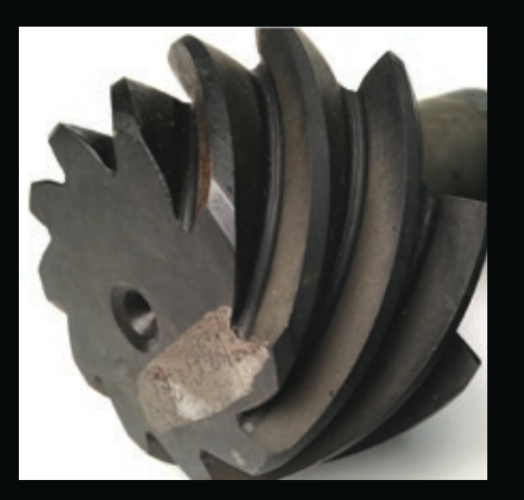
Part Before Process

This is a very small sample of where Versa-Flow Spin-Finish can be used for solving finishing problems.