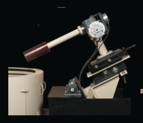
Head Up Load Position