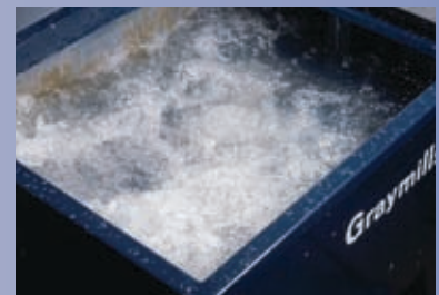
Auto-lid opens at end of cycle Platform raises for draining and easy parts removal