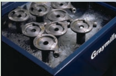
Parts are easily loaded on platform at tank top level Auto lid closes as cycle begins