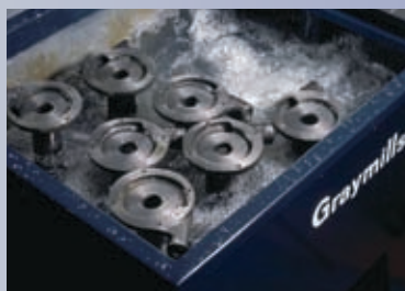
Start cycle lowers parts into solution Fully immersed parts may be soaked and/or agitated with programmable cleaning