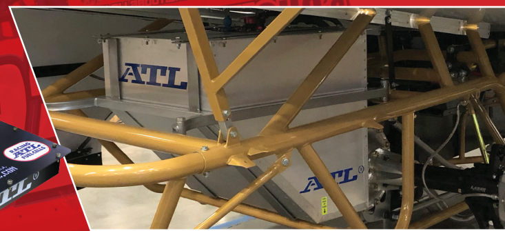
ALUMINUM CONTAINER OPTIONAL FOR 28 GAL. ONLY